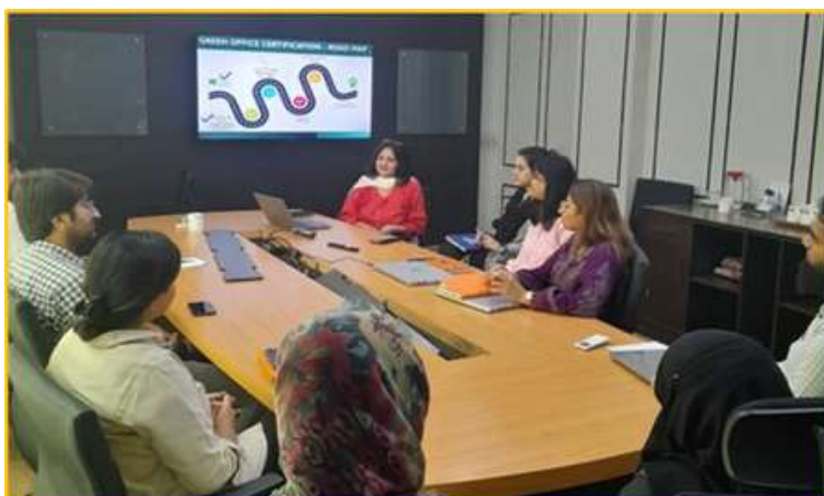
Green Office team meeting at KE House