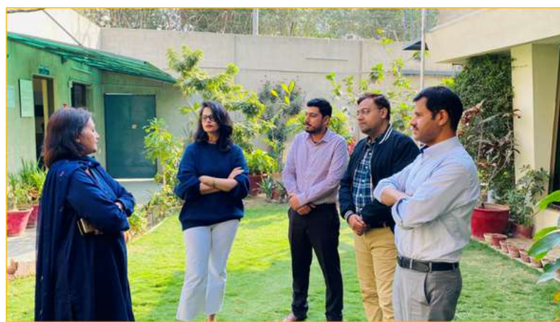
Green Office team meeting at Safety House