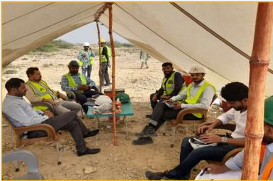
Independent Monitors engaged at NTDC TL

This Policy will supersede all previous BU/Department wise Policies on the subject and is applicable to all KE locations with immediate effect. To have a clear understanding of the Policy, it is mandatory for all employees to read and ensure necessary compliance.