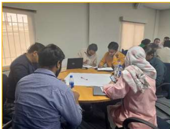
Environmental aspect impact assessment awareness session