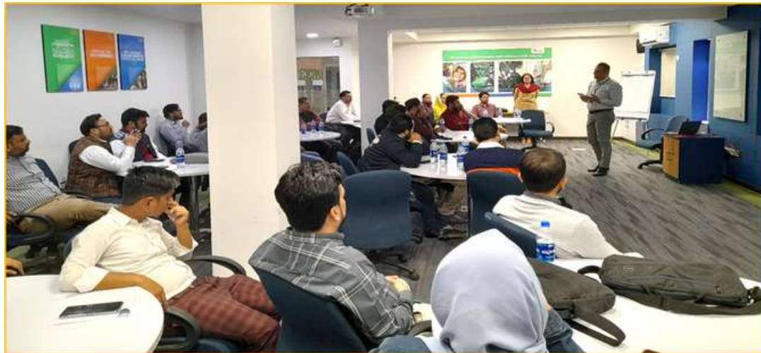
Environmental sustainability management committee meeting held, chaired by Head of CHSEQ